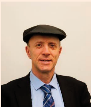
Michael Healy Rae TD Independent (Cathaoirleach)