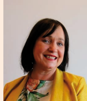
Senator Fiona O'Loughlin Fianna Fáil