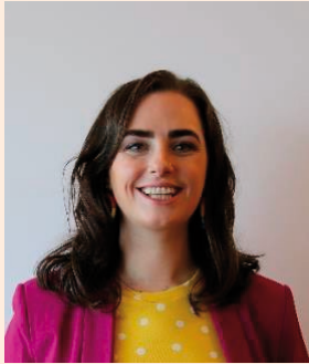
Senator Annie Hoey Labour