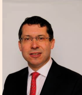
Senator Rónán Mullen Independent