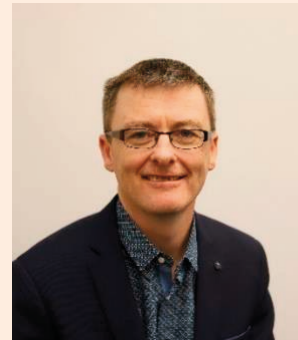
David Cullinane TD Sinn Féin