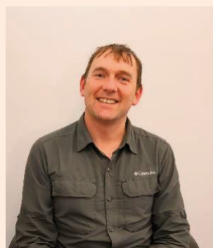
Gino Kenny TD Solidarity -People Before Profit (Leas-Chathaoirleach)