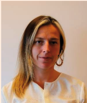
Senator Lynne Ruane Independent