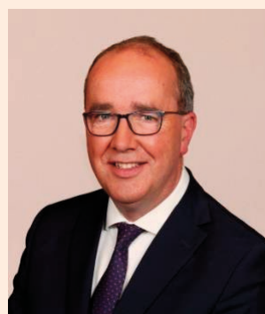
John Lahart TD Fianna Fáil